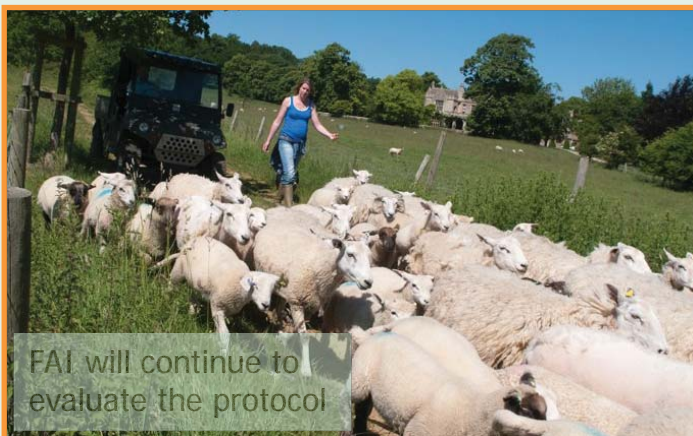
FAI will continue to evaluate the protocol

“ At FAI's farm in Wytham, lameness incidence was 0.5% in June and July, with just two sheep requiring treatment. ”