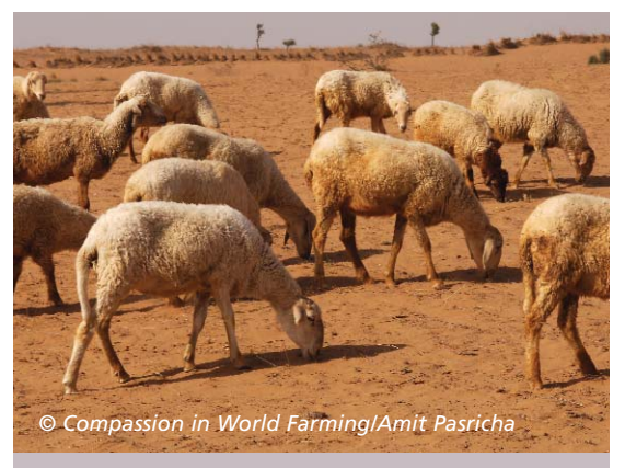
Sheep grazing on arid land in India

The effect of these yield changes has a significant impact on the feasibility of the 72 scenarios: If the CO<sub>2</sub> fertilisation effect is not taken into account, only 34 of the 72