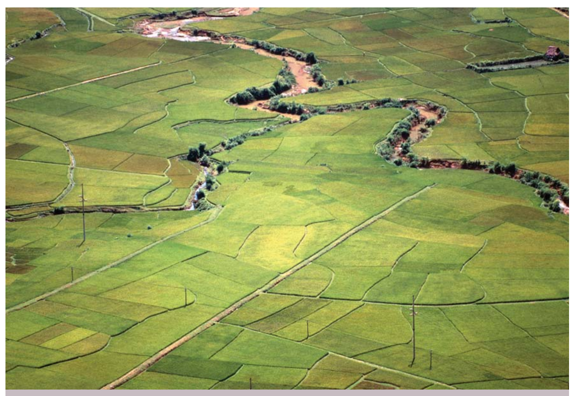
Humans already use 75.5 per cent of the world's land, creating a challenge for feeding the growing population

The full research study, entitled 'Eating the Planet: Feeding and fuelling the world sustainably, fairly and humanely' focused on land and biomass use, including cropland farming, livestock rearing, bioenergy production and conversion of primary biomass to food and fuel. It was not within the scope of the primary research to consider the social, economic and political factors which influence decisions on production, diet, land use or choice of technology. This briefing summarises the findings of the study and looks at their implications.