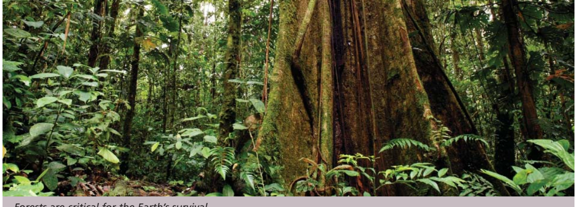
Forests are critical for the Earth's survival