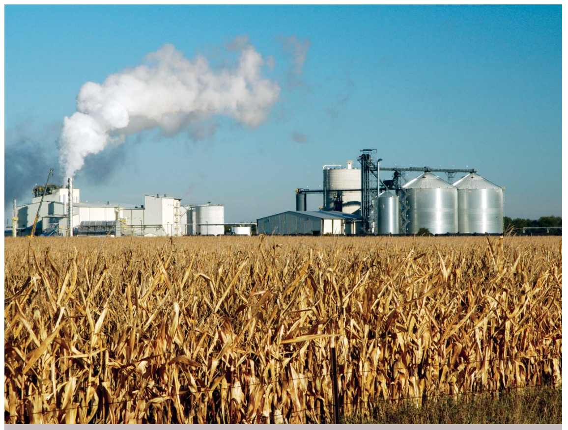
Large-scale production of biofuels will lead to an increase in food scarcity and rising prices

A wealth of studies from international organisations - the FAO, the World Bank, the OECD and the Royal Society amongst others have warned that exploiting the world's theoretical bioenergy potential will have dramatic negative social and ecological impacts, such as further pressure on small farmers and communities that depend on the land, upward pressure on food prices and land rights conflicts. It could also trigger indirect land use change such as deforestation in South East Asia and Latin America. In the worst cases this would result in net increases in greenhouse gas emissions.