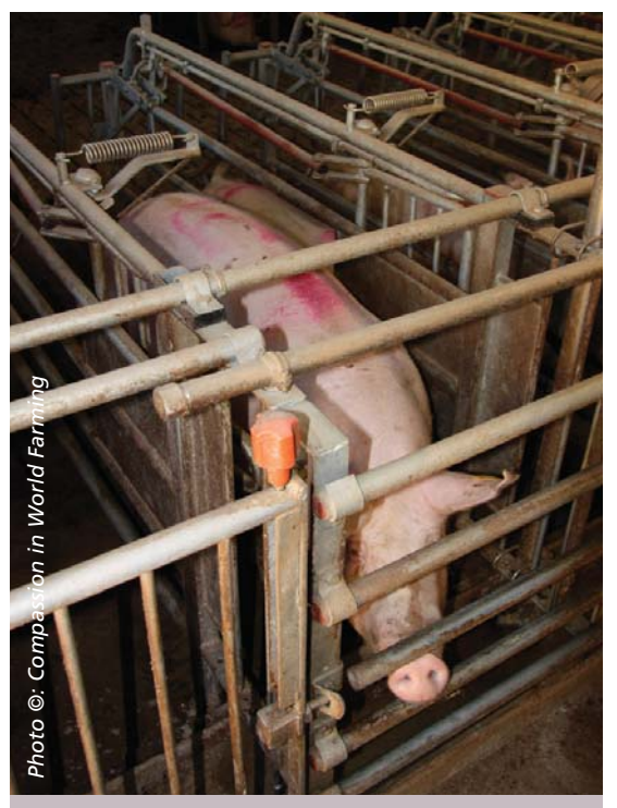
Sow stalls in an intensive pig farm, Denmark