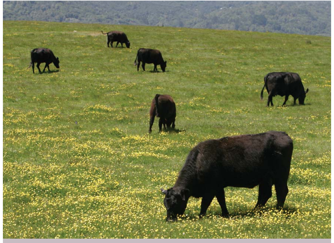
We can feed the world using humane and sustainable farming

Forests It is clear from this research that deforestation is not required to feed the world, yet deforestation continues. Protecting forests – essential if we are to prevent runaway climate change, irreversible biodiversity loss and damage to ecosystem services – requires a strong and fair global agreement on forest protection as well as a concerted effort to support countries in implementing and enforcing national policies. Action at national and international level should recognise the rights of forestdependent communities and avoid measures that would commoditise forest resources.